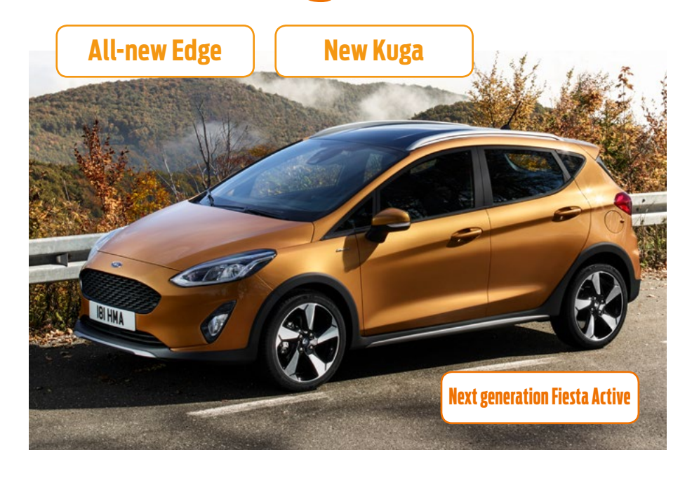
Ford will introduce 5 new SUVs by 2020 , including...