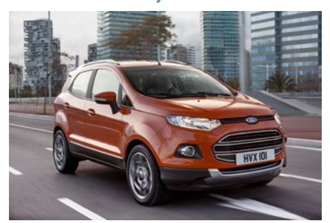
Ford Kuga medium SUV = 119.400